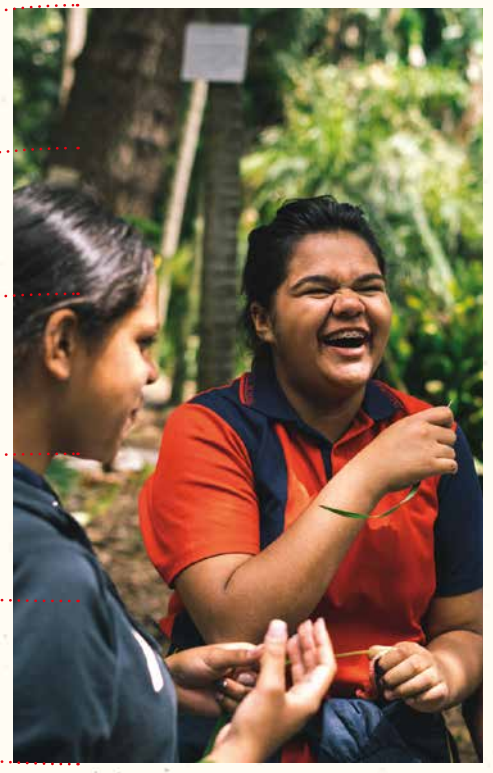
Poetry in First Languages Gadigal workshop.

— Ali Cobby Eckermann 'Wind Song Lament' Extinction Elegies