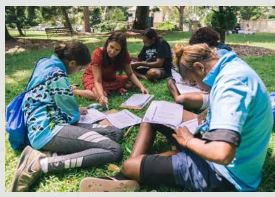
Gadigal workshop at Royal Botanic Garden Sydney.

— Emmanual, Laramba School, NT Poetry in First Languages (Arrente)