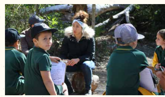
Poetry in First Languages East Nowra PS at Bundanon.

Over the years I have seen, and even written, in many annual reports. The Red Room Poetry report is different, for while it fulfils statutory obligations, it swerves wide of conformity to provide something of the flavour with which we deal on a regular basis. For me the association with an organisation that dwells on poetic themes and words, is a panacea in a world increasingly at odds with itself. Poems allow expressions of both truth and imagination – they are the canvas upon which we can dwell, interpret and absorb.