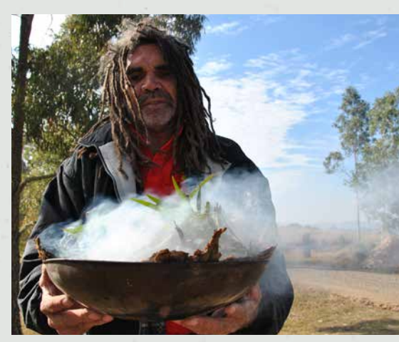
Smoking ceremony Unlocked Balund-a.

— Green Square School 'Green Square, What's Good?' Youth Unlocked