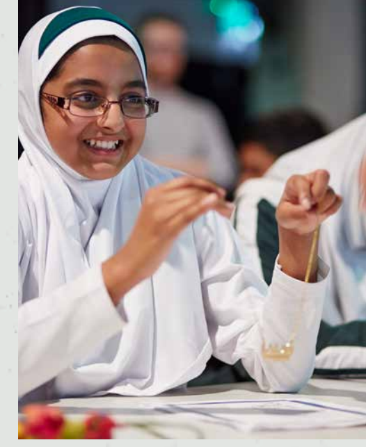
Poetry Object workshops. ImageTawfik Elgazzar

— Shyam 'My Inheritance' Poetry Object Regional Express Winner