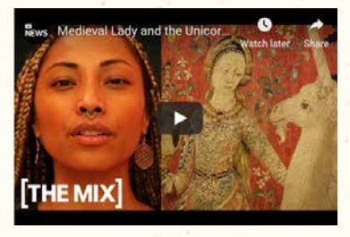
ABC TV The Mix